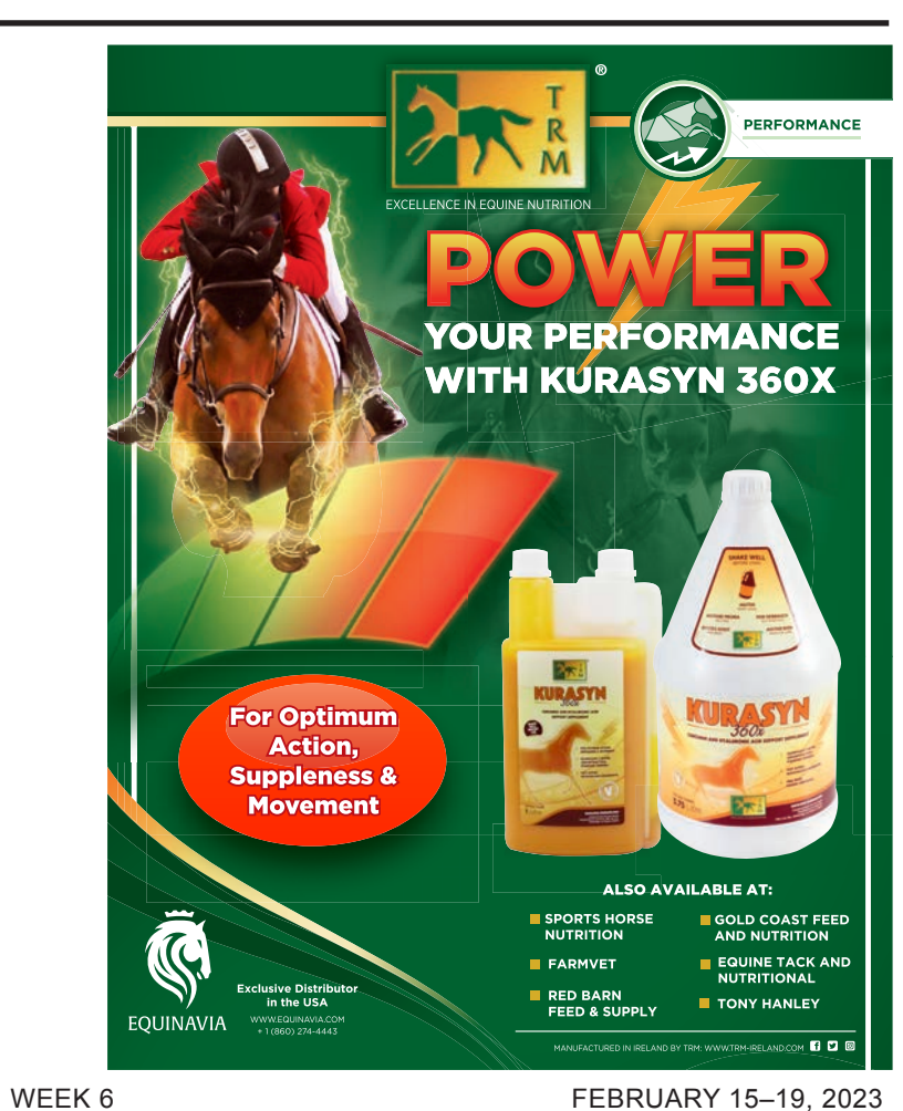
FEBRUARY 15-19, 2023