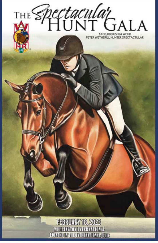
ARTWORK BY TORI BILAS

Don't miss your chance to reserve your table! For more information or to purchase a table or ticket, visit the USHJA tent adjacent to the Grand Hunter Ring.